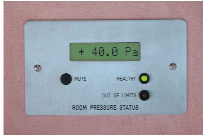
Plate : Standard Double gang plate fits standard flush back box 47mm deep White plastic, Powder coated to RAL colour, Brushed Stainless steel Other finishes available

Backlit 16 digit LCD display. Standard double gang plate Flush anti -glare window. 0 - 10Vdc inputs. Up to three LEDs and Buzzer / Mute Alarm can be configured as a High level, Low Level or activated by 24V digital inputs. Relay contacts for remote alarm